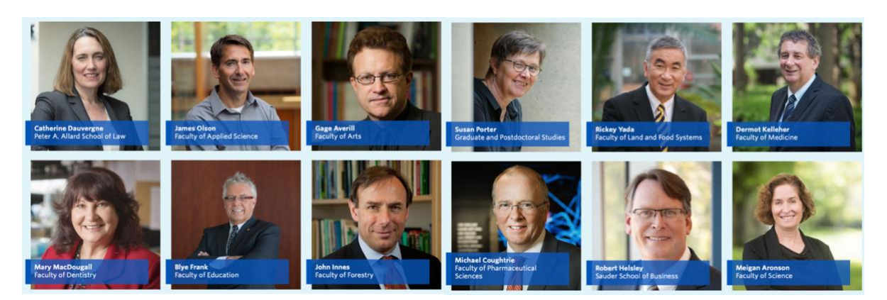
Figure 1. Meet the Deans (UBC-V) and meet the balance of 6 UBC-O Deans.

Visible minorities are defined in Canada's Employment Equity Act as "persons, other than Aboriginal peoples, who are non-Caucasian in race or non-white in colour." Employees and researchers use a variety of methods for demographics, including self-identification and observation of readily apparent or "visible" characteristics (Settles, Buchanan, & Dotson, 2019; Song, 2020). UBC's (2019a, 2019b, 2019c) core methods include Employment Equity Surveys, Systems Reviews, and Workplace Experience Surveys (WES). Demographic methods have unique limitations and cautions. For example, in transforming invisibility to visibility, employers and researchers risk creation of hypervisibility for visible minority faculty, or "heightened scrutiny and surveillance where failures are magnified and individuals lack control over how they are perceived by others" (Settles, Buchanan, & Dotson, 2019, p. 63). We also acknowledge that racial visibility can be ambiguous and, with discretion, feel the reward outweighs the risk of helping UBC make its demographics visible and overcome color-blindness.