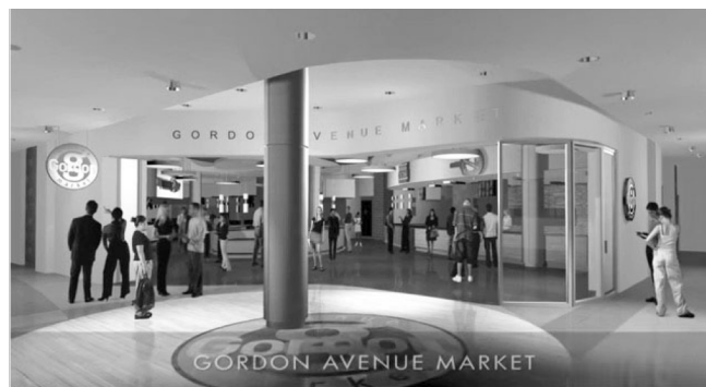
Digital Representation of Gordon Commons market

These scenes of false and placid distinctions illustrate the experience of alienation and anomie that corporate concepts like synergy and vertical integration produce when they are incorporated into a university's spatial self-representation. Indeed, every aspect of this production, from the construction of the space to the actions of its participants, expresses the neoliberal university's