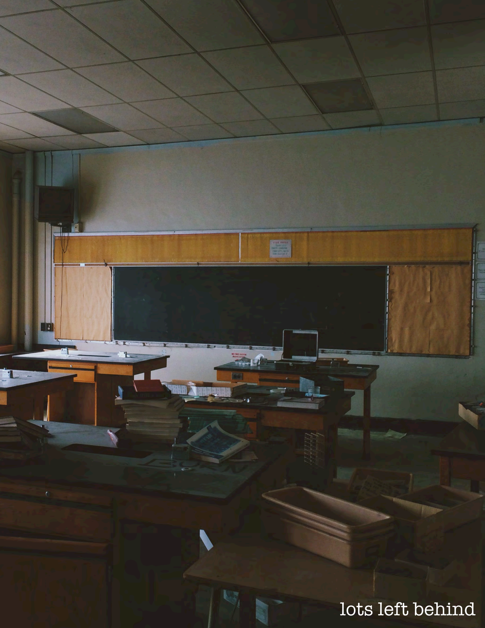
lots left behind