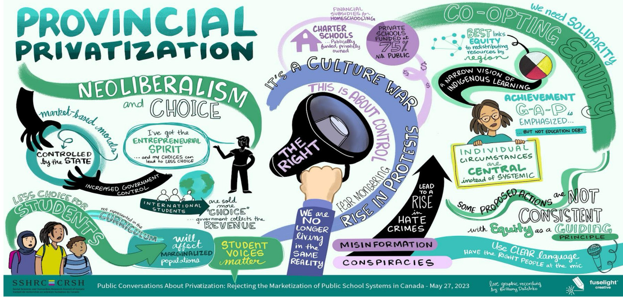
Figure 2. Graphic Recording of Symposium Presentations and Roundtable Conversations on Privatization at the Provincial Level. 2