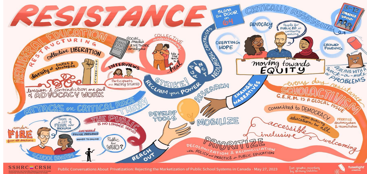
Figure 3. Graphic Recording of Symposium Presentations and Roundtable Conversations on Resistance to Privatization. 3