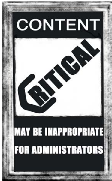
Figure 4. “Critical Content Warning” (C. Peters, 2012).