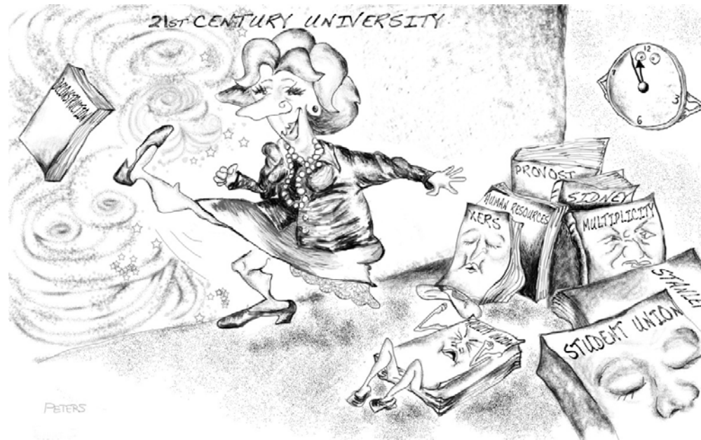
Figure 2. “Emily Post-Ideology,” (C. Peters, 2012, adapted from Schauffler, 1974, n. 60 below).

(good) from negative (bad) subjects or texts. More implicit but as pernicious is a censoring of critique on vaguely articulated aesthetic, customary, literary, or philosophical grounds. Granted, for a good percentage of students, critophobia plays on senses of entitlement and the “the right to present my views without being criticized” and preferences for “brand loyalty” over “educated critique.” 104 For others, criticism, deconstruction, and rhizomatics are compromised one in the same in cynicism. Critophobia or critical text type avoidance exchanges the properties of the critical narrative for the metanarrative (or the rhetoric for the metarhetoric); with the new critique, or little ethics of critique, perhaps there is a modicum of celebration or tolerance for a petit critique ? This might be a minor concession that the intellectual world is not yet Emily Post-ideology (Figure 2).