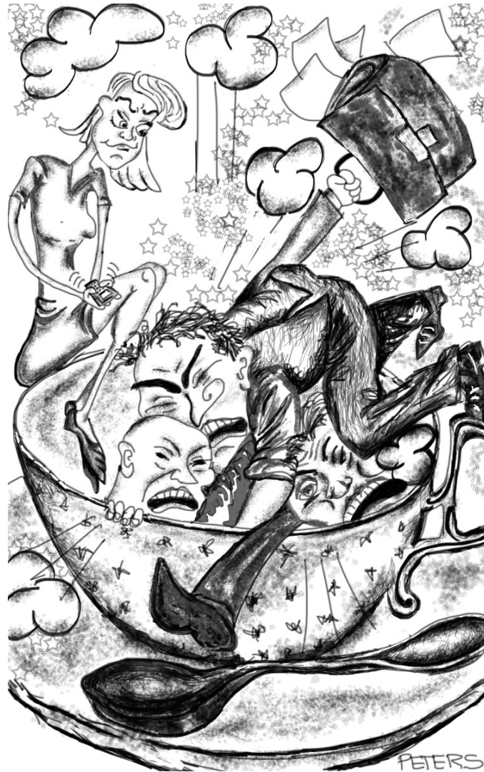
Figure 3. “Tempestuous Teacup” (C. Peters, 2012).

and centrists, invoking Spiro Agnew, the eerily familiar voice of the silent majority, may reason that the new critique provides the irritable raucous minority with yet another cause. The esteemed “large and normally undemonstrative cross section” that customarily refrains from articulating a public opinion, as the New York Times portrayed this mythical figure following Nixon’s speech in November 1969, may quietly or secretly note that no one really cares about passé exchanges and ideas that cloud dialogue with debate. Also conjuring up Schlesinger’s “Vital Center,” why binarize ‘judgmental-impartial-charitable’ or ‘negative-balanced-positive’ to distract from a ‘both-and’ mainstream intersectional civility? Moderates may be concerned that even though the net effect of the new critique is zero, or on whole a slight positive valence, this can make the silent majority and vital center more reserved and tacit by amplifying interest on something downstream that is not very interesting, making for a needlessly tempestuous teacup of existence (Figure 3). And hopefully, all might consociate for one moment, with one common voice, to shout back we don’t want to be governed like this, at this time. 108