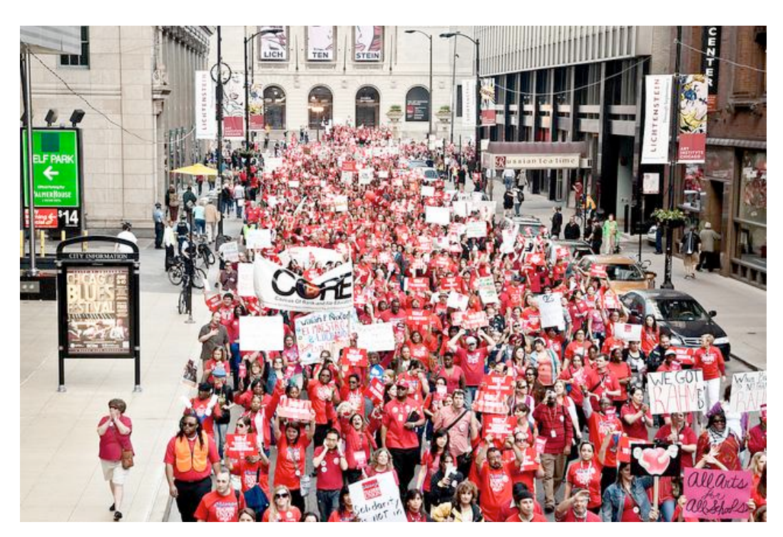
Image 1. All photos and images are from the 2012 Chicago Teacher's Strike.