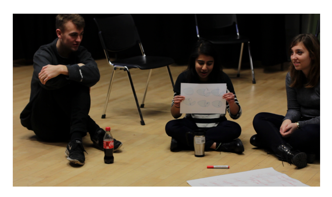
'I think, for me, the most interesting bit was getting to know other people's views. It was about different departments, but it was as much about different cultures.'

In order to cultivate a process of genuine transdisciplinarity among a new group of scholars from diverse backgrounds, disciplinary perspectives, and ideological orientations, I began the process by spending time on establishing a common language for effective dialogue. This meant building solid foundations of mutual respect and friendship. A vital part of this process was to start by bringing the scientific question we planned to explore – what is money? - back to a more primal emotional and experiential level. Consequently, participants spent the first two weeks of the Project building democratic foundations through the cultivation of practices of deep listening and empathy. In Week Two, we used art materials to explore our personal relationships with and feelings towards money, going deeper into biographical territory.